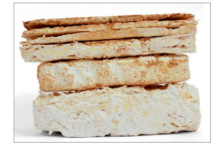
Figure 3. Mycelium-based composite (Source: Wikimedia Commons).