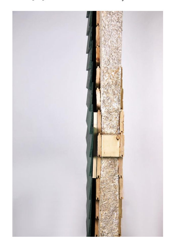
Figure 4. Mycelium-based composite. (Source: Courtesy of Ecovative).

interposed to two layers of pine wood (Figure 4), grows in a few days, generating a light and homogeneous compound, comparable to classic polystyrene [29]. Other interesting uses of mycelium in architecture can be found in projects such as Breeding Space by Maria Mello [30] or Grown Structures by Aleksi Vesaluoma in collaboration with Astudio [31].