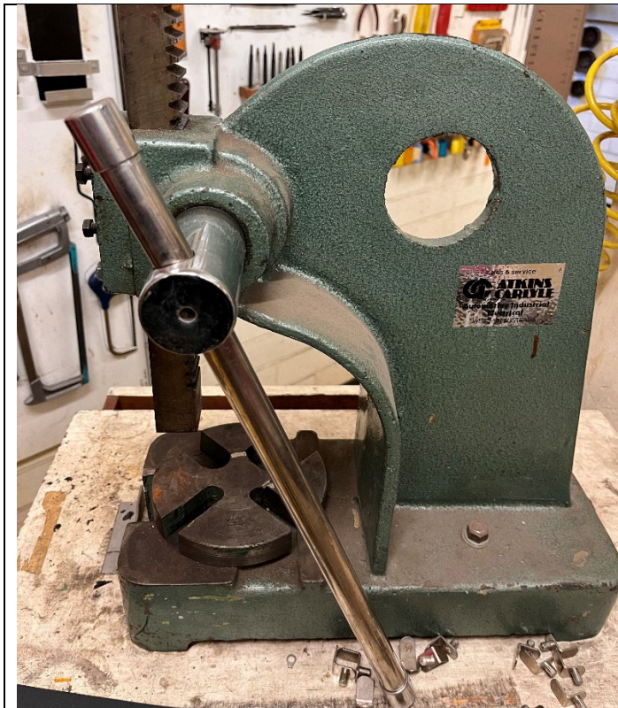
a) Bench-mounted hand press